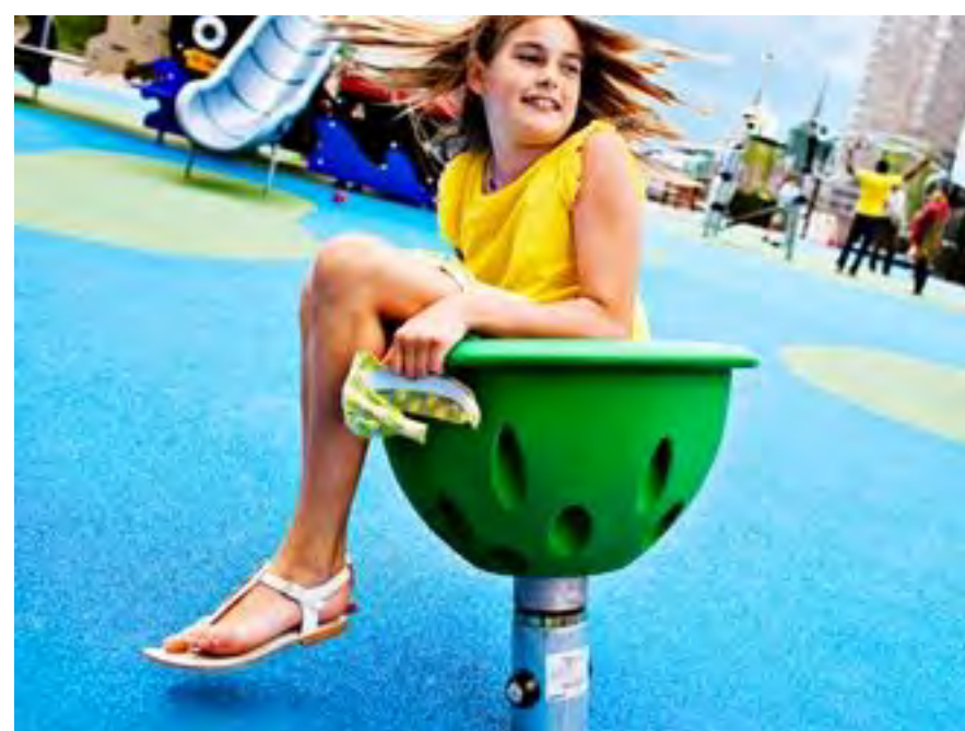
SPINNER BOWL KOMPAN SEE SPECS