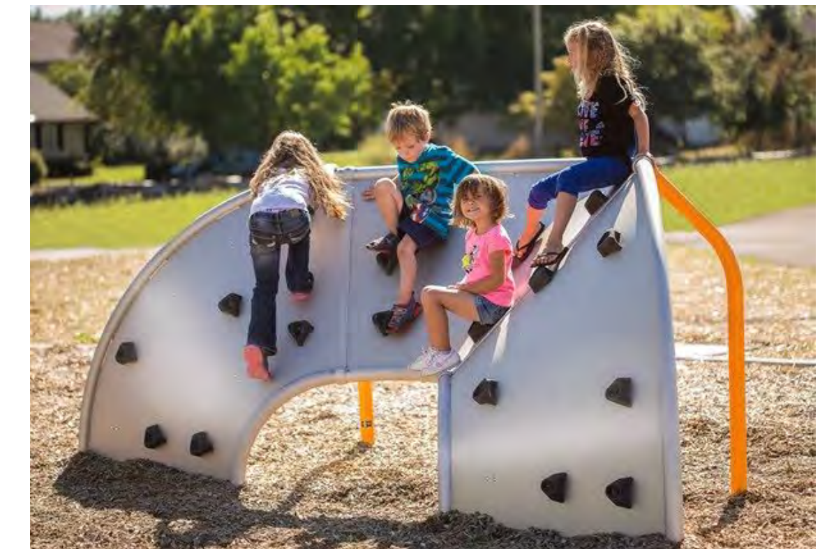
3 PANEL MOBIUS CLIMBER LANDSCAPE STRUCTURES SEE SPECS