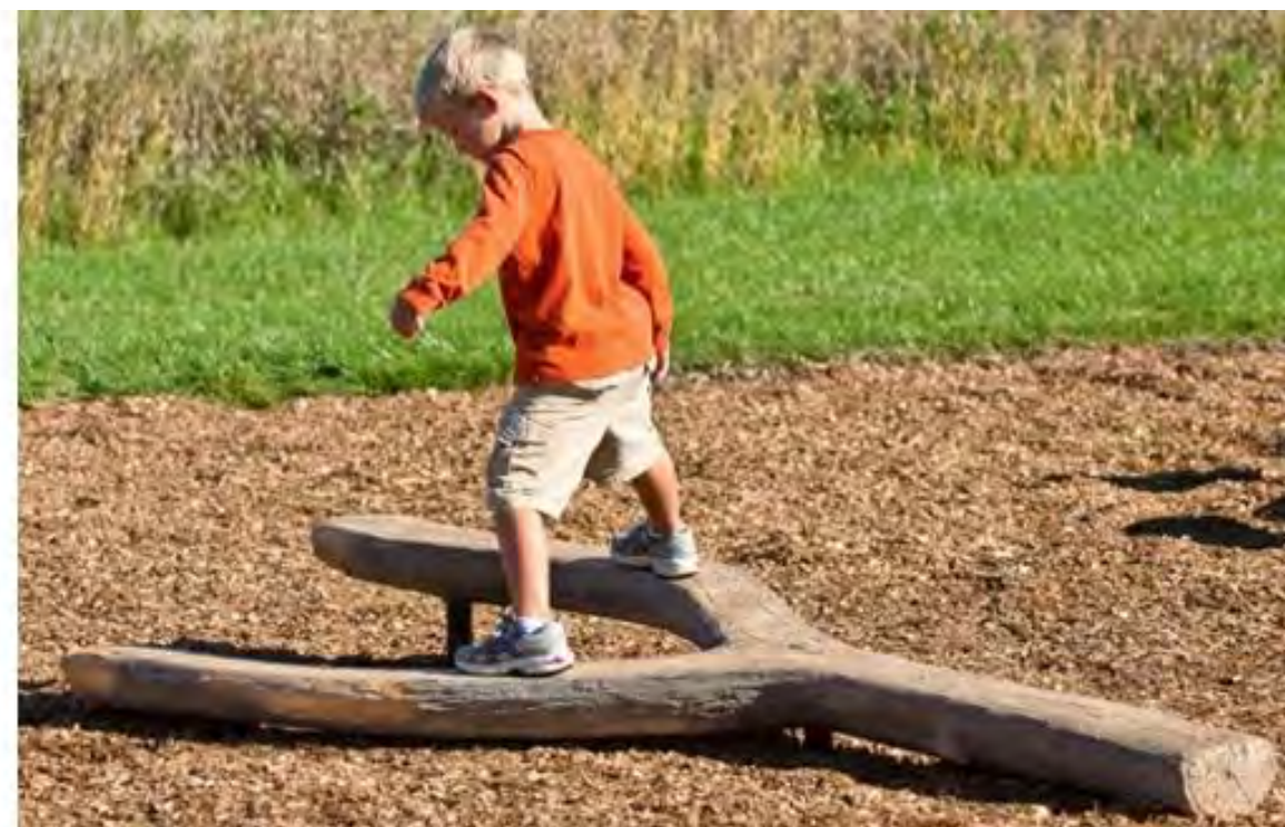
GFRc LOG BALANCE BEAM LANDSCAPE STRUCTURES SEE SPECS