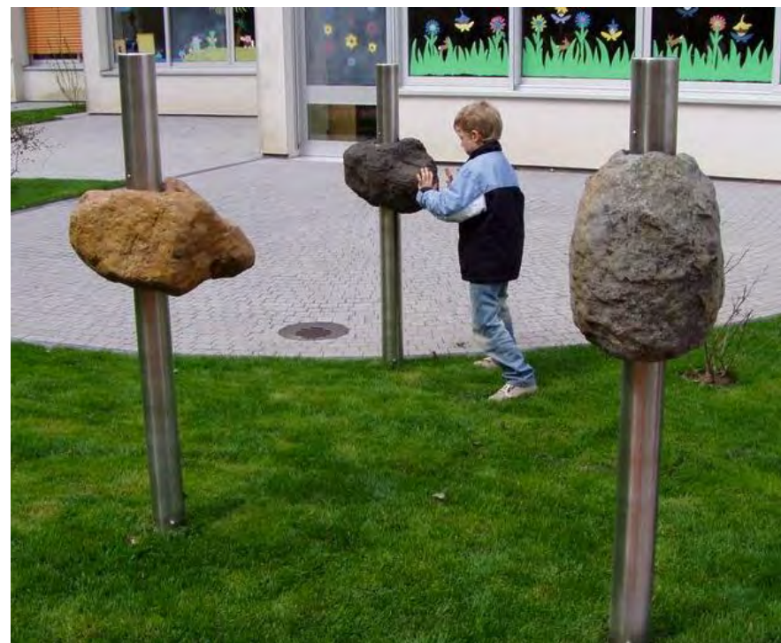
FLOATING ROCKS GORIC SEE SPECS