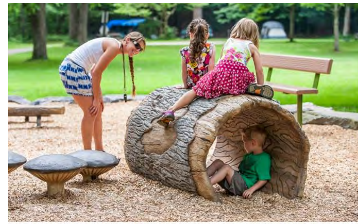
CUSTOM GFRc LOG CRAWL TUNNEL LANDSCAPE STRUCTURES SEE SPECS