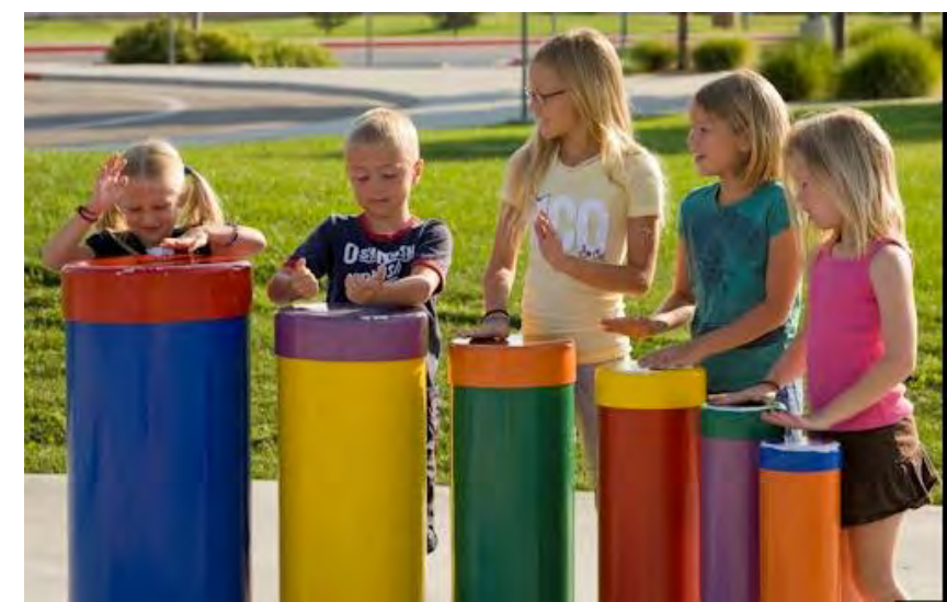
TUNNED DRUMS HARMONY PARK SEE SPECS