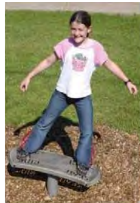
PLAY MOTION ALPINE RIDER KORAT SEE SPECS