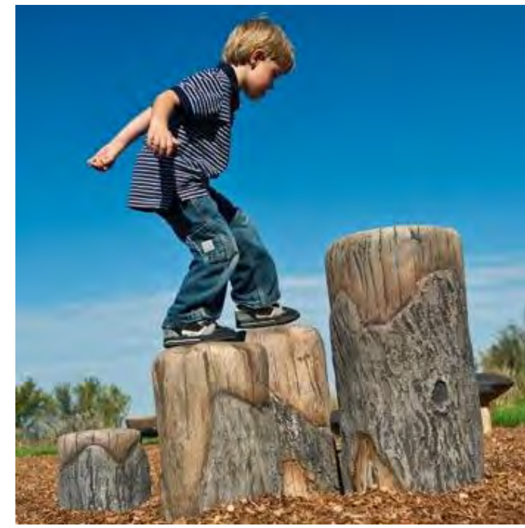
GFRc LOG SEAT LANDSCAPE STRUCTURES SEE SPECS (SEE SHT. L1.5 PLAN FOR HEIGHTS)